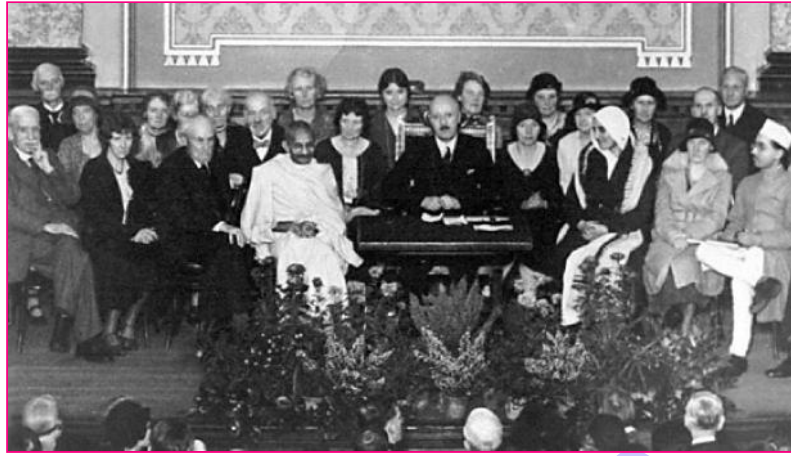
Mr. Gandhi and Mr. Henry S. Salt on the London Vegetarian Society's Social Meeting on November 20th, 1931.