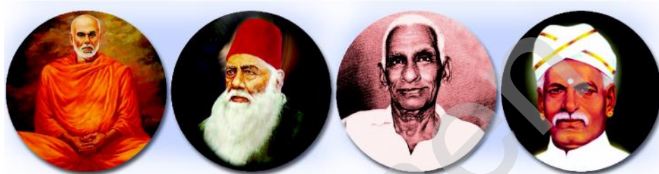
a. .... b. .... c. .... d. ....

Observe the following pictures of social reformers and identify them.