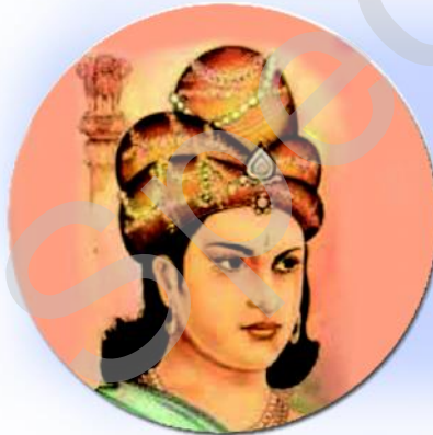
Ashoka the great

Ashoka developed a comprehensive system of social welfare. He appointed a superintendent to look after the welfare of women. The welfare programmes were under the overall charge of High Commissioners of Charity (Dharma mahamathras). Many reforms were introduced in the field of women's welfare, rehabilitation of prisoners, rural development, free medical care, regulation of prostitution and provisions of public utilities like roads, wells, rest houses for travellers etc.