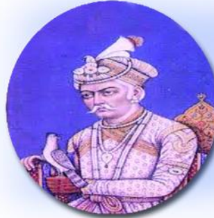
Akbar the great

The duties of a King included the maintenance of peace, protection from external attack and to provide justice. Malik Ali, a noble of Balban, was more generous in giving alms. Gias-Udheen Thuglak was